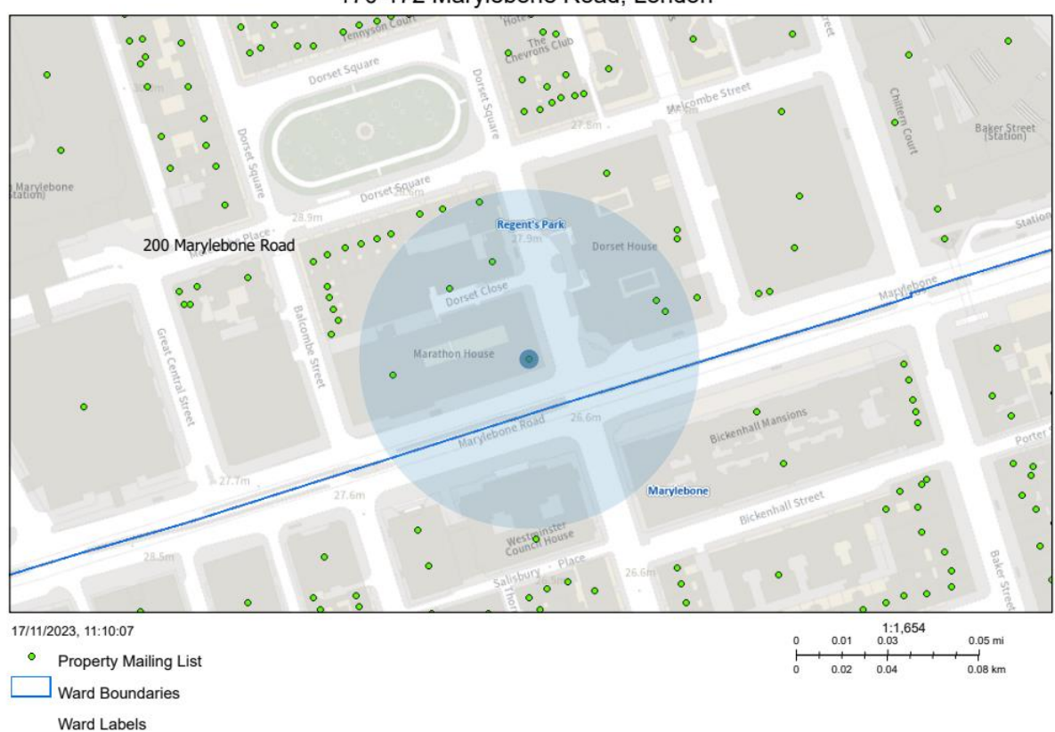
170-172 Marylebone Road, London